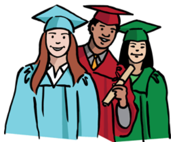
Our Church's Graduates

Below is the contact information for three of our recent graduates who left home in August for college. Whether you or your family can drop a note, share your child's artwork, or send a package, please keep them in your prayers as they meet new friends, adjust to life away from home and acclimate to their school schedules.